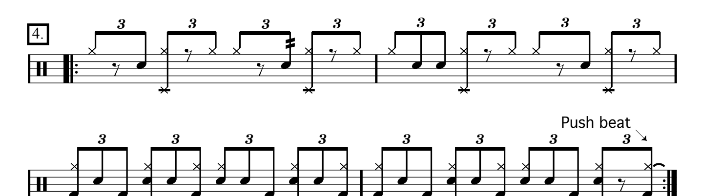
Copyright (C) 2014 by John Xepoleas. All rights reserved.

Once you are comfortable playing all three patterns we'll combine them to create a "4 Bar Phrase". Play a "Push Beat"at the end of the phrase then then repeat back to the beginning. NOTE: <u>Do not play</u> the note in the middle of the triplet on the 4th beat of the measure before the push beat.